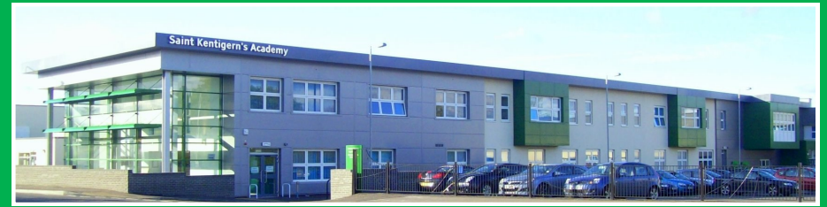
St. Kentigern's Academy